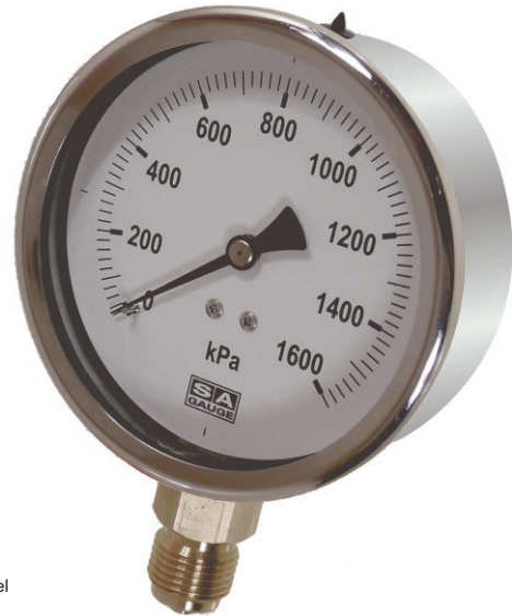
Type R Roll Ring Bezel

For dimensional drawing see technical section