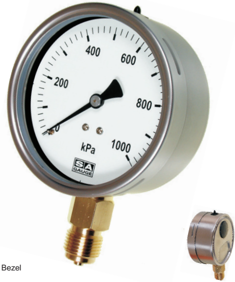
Type T Bayonet Lock Bezel

For dimensional drawing see technical section